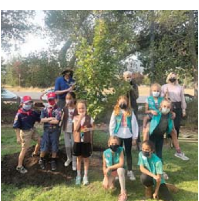
Scouts surround newly planted maple tree.