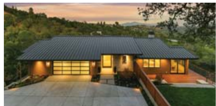
125 Camellia Lane, Lafayette | Stunning Happy Valley New Construction with Views